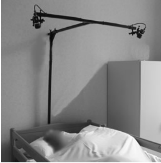
Fig. 1. Flexible camera stand placed in the patient's room

used is an Adaptec RAID 1430SA with an a PCI Express x4 slot. This controller supports up to four SATA hard disks.